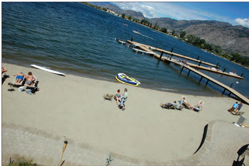
LEFT: Palapa Beach is the private retreat reserved for those staying at Walnut Beach Resort. The beach is right on Osoyoos Lake, Canada's warmest, and includes a private dock that offers numerous boat slips. BELOW: The Sun Arbour Pool Terrace features two hot tubs and a heated pool.

Examples: classic Caesar salad ($10), corn-husk-wrapped filet of wild sockeye salmon ($21), broiled lemon garlic tiger prawns ($22), sirloin steak